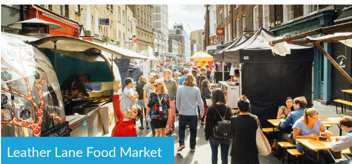
Leather Lane Food Market

Important: These property particulars are believed to be correct but their accuracy cannot be guaranteed and they do not form part of any contract.